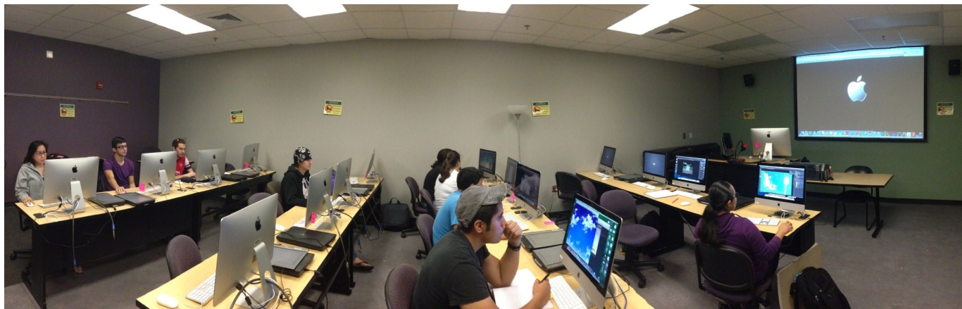
The new Visual Arts & Music “Mac Lab” where students engage in graphic design and other activities.

The South Texas College Visual Arts & Music program promotes the understanding and appreciation of the visual and musical arts for students, faculty & staff, and the communities of our South Texas College campuses.