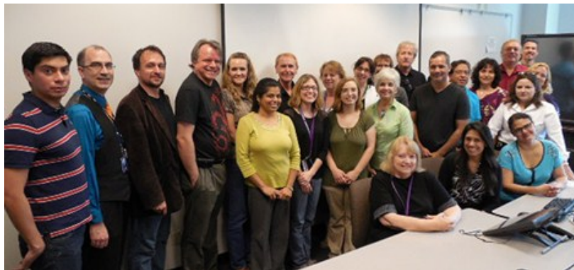
The English Department of South Texas College—April 2014