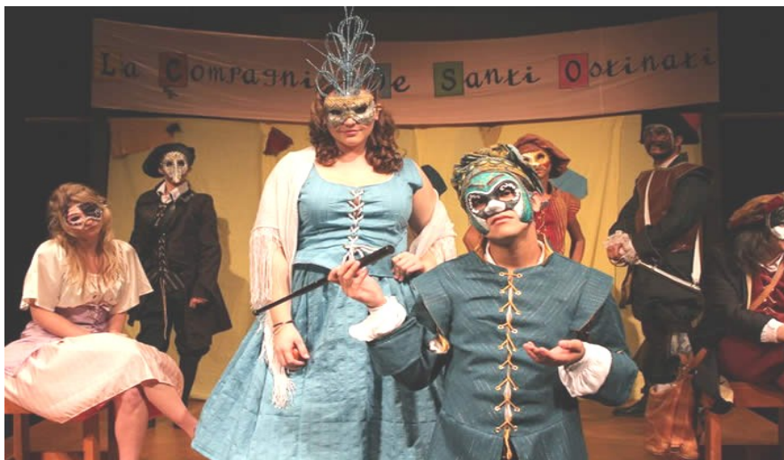
A Company of Wayward Saints presented by South Texas College's Drama program