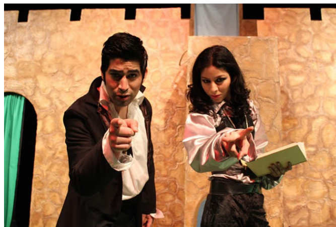
The Brothers Grimm