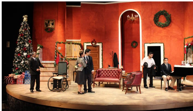
The Man Who Came To Dinner