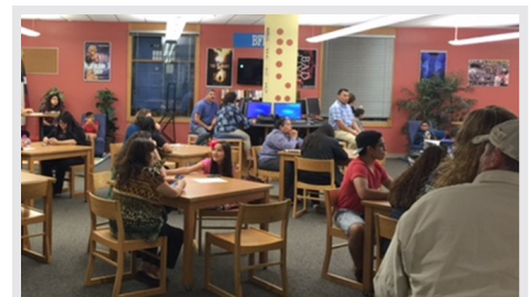
Weslaco East HS Student and Parent Meeting

The Office of Institutional Effectiveness & Assessment