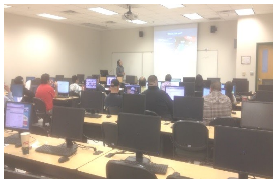
CS Professional Development Spring 2016